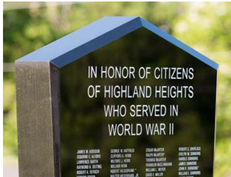
Memorial Day Ceremony May 28 @ 8:30 am - 9:00 am

The City of Highland Heights Administration and Public Works Department Offices will be closed on Memorial Day, Monday, May 28, 2018. The offices will reopen on Tuesday, May 29, 2018 at 9:00 a.m.