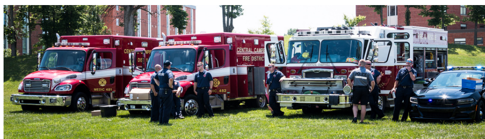
Touch A Truck