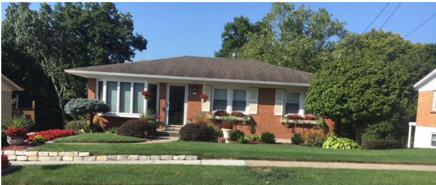
Yard of month for September - 210 Knollwood