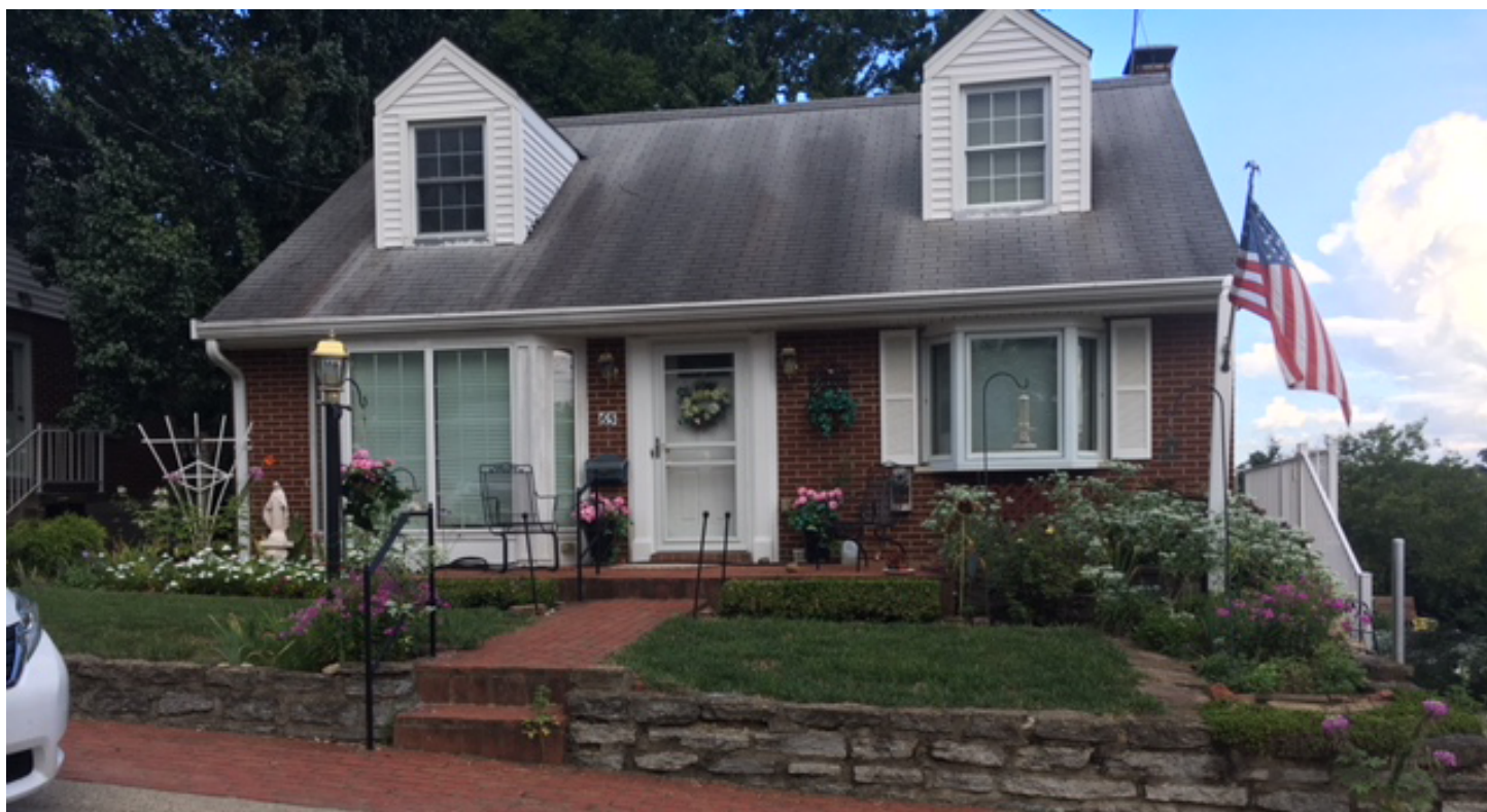
Yard of month for August - 65 Maple