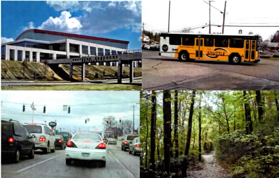
Transportation is a main component of the Comprehensive Plan