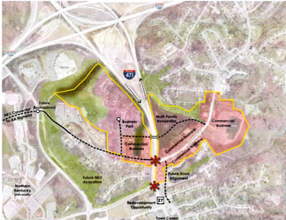
The northern entry points of Highland Heights are named Gateway East and Gateway West in the 2019 Comprehensive Plan